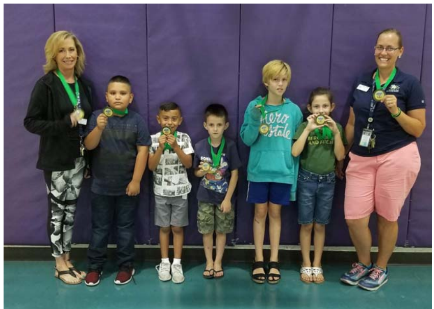
Community Garden and 5-2-1-0 Challenge Participants